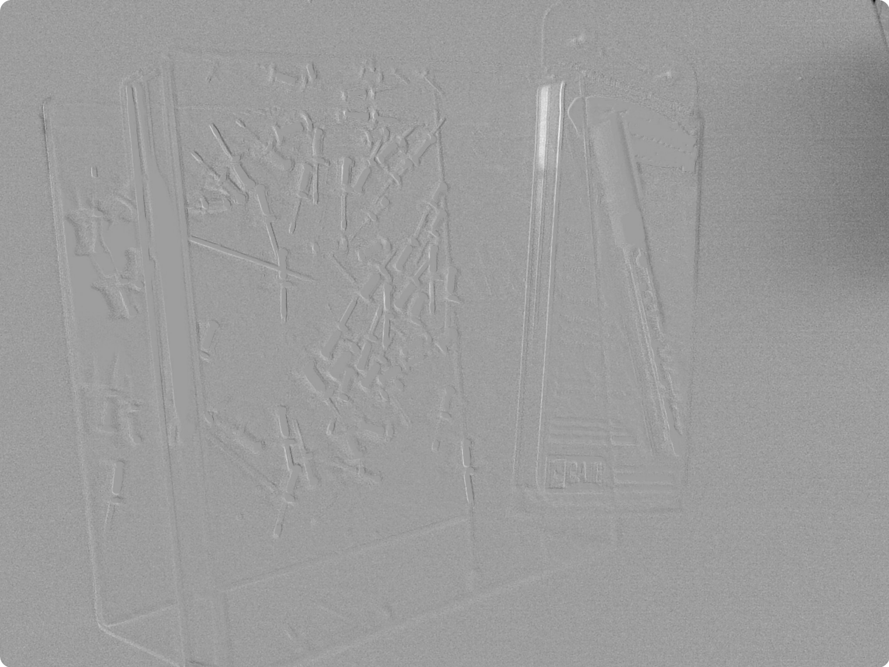
This is the resultant image of subtracting TacsinBinReplicate from TacsinBin